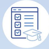
Category 3. Student's learning assessment