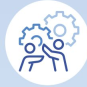
Category 4. Impact and mission with and for society