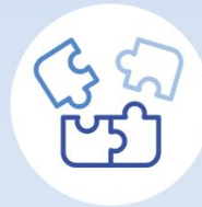
Inclusion and diversity