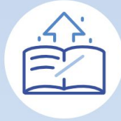
Category 1. Student-centred course design