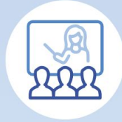
Category 2. Innovative teaching and learning