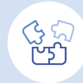
Inclusion and diversity