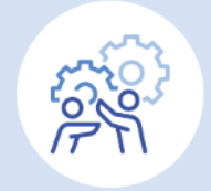
Category 4. Impact and mission with and for society