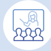
Category 2. Innovative teaching and learning