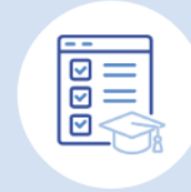
Category 3. Students' learning assessment