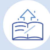
Category 1. Student-centred course design