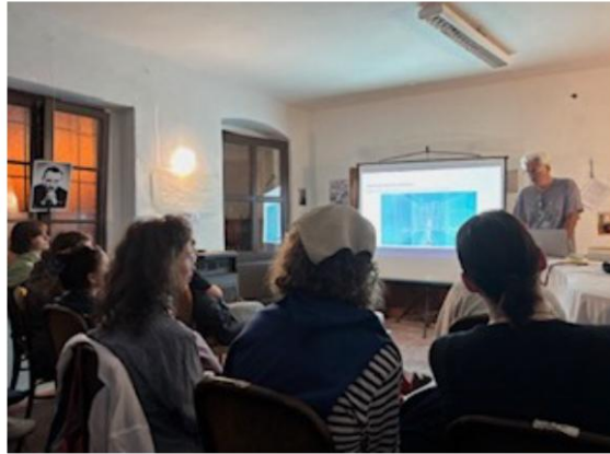
Virtual space – theater and stage