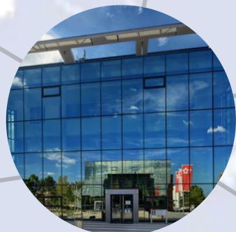
University of South Bohemia in České Budějovice