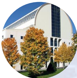
Public University of Navarra Spain