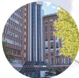
Aston university Birmingham United Kingdom