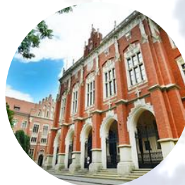
Jagiellonian University in Kraków Poland