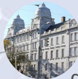
Comenius University Bratislava Slovakia